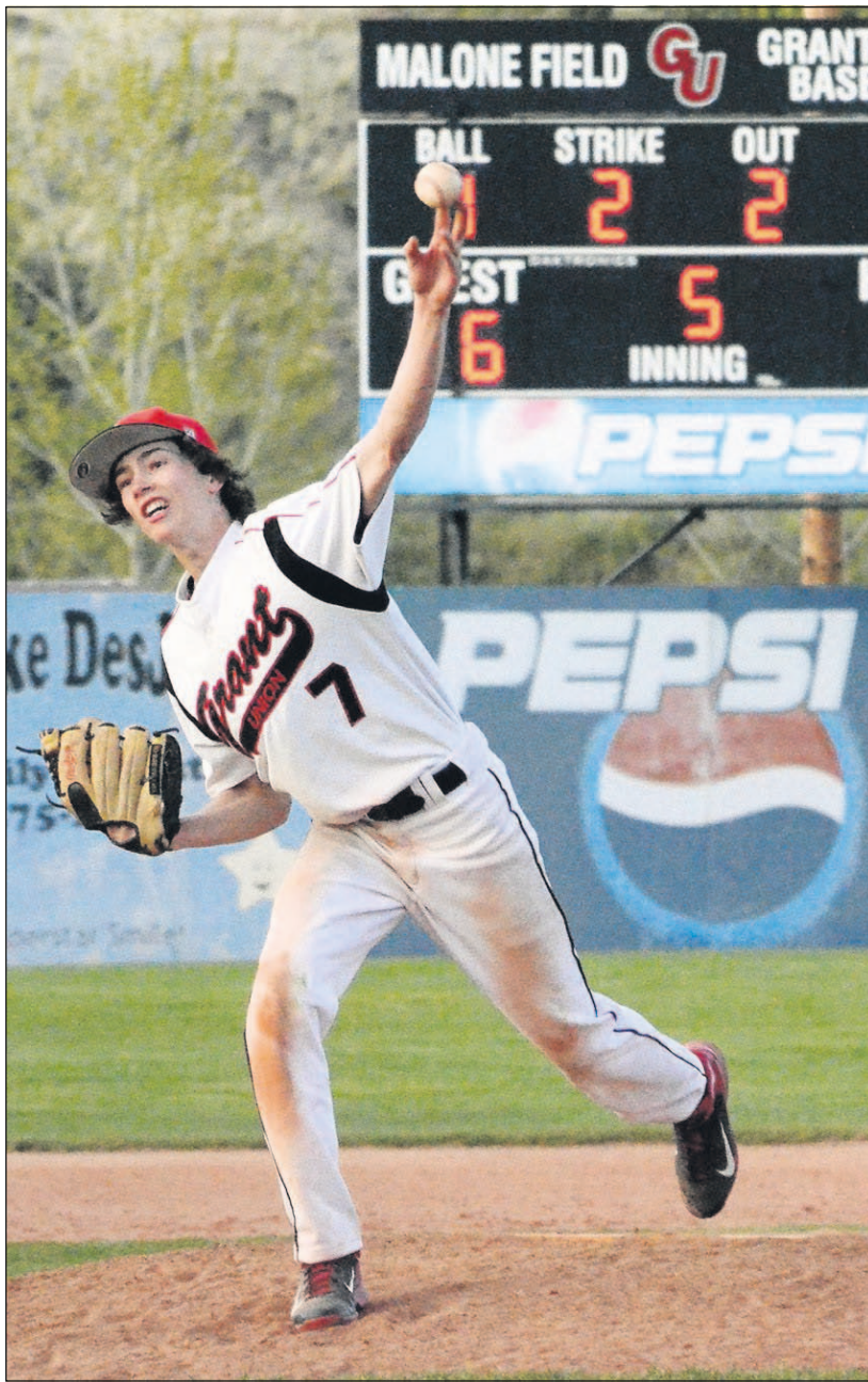
The Eagle/Angel Carpenter

“Ty ended up catching five games in three days,” Delaney said.