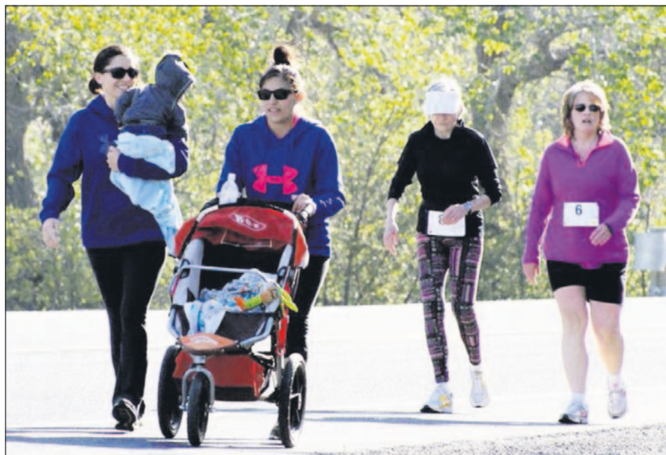
A quartet of ladies, with a youngster in tow, stride together along the highway.