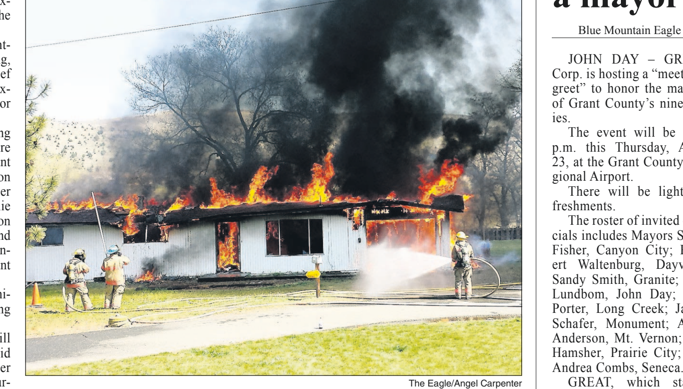
Volunteer firefighters from three area departments gathered for live fire training on Saturday in John Day. The building used for the "Burn to Learn" was provided by the Forest Service, a decommissioned house at the Forest Service Compound off Ford Road near Blue Mountain Hospital.

Arrangements are still being made, but he said he expects to have another burn to learn this Saturday using a couple of vacant homes near the John Day City Park on Canton Street.