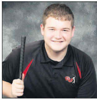
Contributed photo/Tanni Wenger Photography Studios Nathan Gehley

The trip includes three rounds of 18 holes of golf; one