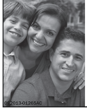
Balance Today with Retiring Tomorrow No matter where you're starting from, COUNTRY can help you achieve financial security in retirement. It starts with listening o your situation. Then we help you build a straightforward Jan with step-by-step guidance. Call me to get started today.

Grant Union hosts the Les Schwab Icebreaker Tournament this Thursday-Saturday and will play the winner of Country Christian vs. Oakland at 11 a.m. Friday. The Prospectors also will hold heir annual fundraiser dinner and auction at 6:30 p.m. Friday at Grant Union.