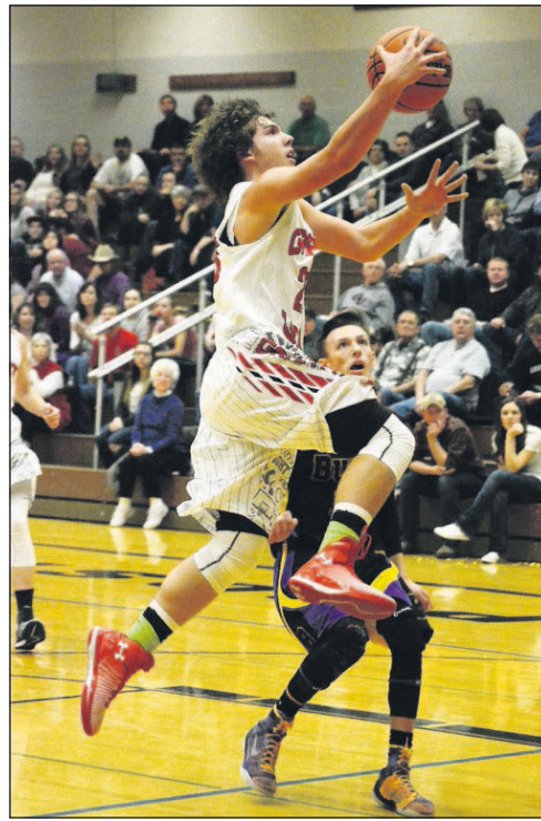
The Eagle/Angel Carpenter