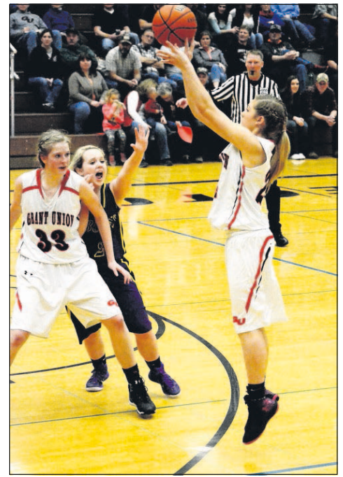
The Eagle/Angel Carpenter