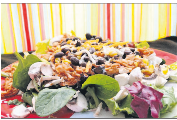
Barbecue Chicken Ranch Salad