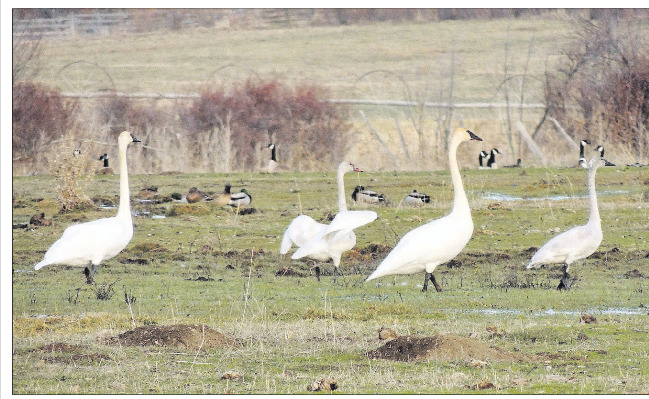
A small flock of swans shares roaming territory with ducks and Canada geese on ranch property just south of Mt. Vernon. The swans have been spotted off and on in the area over the past week.