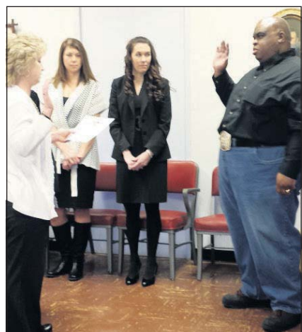
Forest Commissioner Nicky A. Sprauve takes the oath at the Grant County Courthouse.