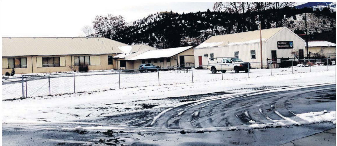
The site for the Library Foundation’s new library building is a vacant portion of the lot that’s home to the former junior high building and Kam Wah Chung Interpretive Center.