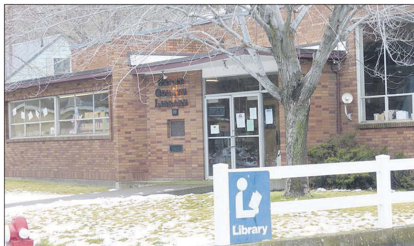
The current library, at 507 S. Canyon Blvd., in John Day, draws patrons from across the county but library supporters say a new, modern library would provide more space for the collection, computer use, and community activities that encourage literacy and reading.