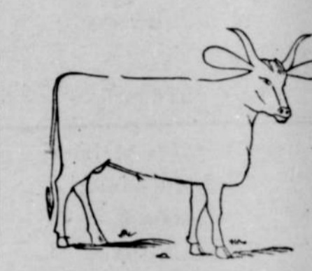
FREE BRAND COLUMN.

Donnellan & Co., Agts., 519 MONTGOMERY ST., S. F., CAL.