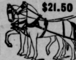
No. 1. Farm Harness.