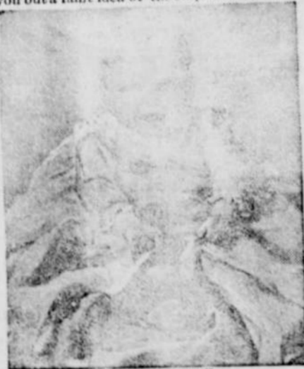
"I'M A DAISY."

Maybe you think this is a new business, sending out babies on application. It has been done before, however, but never have those furnished been so near the original samples as this one. Everyone will exclaim, "What a little baby!" which everyone can give you but a faint idea of the exquisite original.