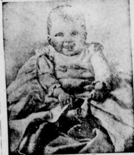
"I'M A DAISY."

Maybe you think this is a new business, sending out babies on application; it has been done before, however, but never have those furnished been so near the original samples as this one. Everyone will exclaim, "Well! that's the sweetest baby I ever saw!" This little black-and-white engraving can give you but a faint idea of the exquisite original.