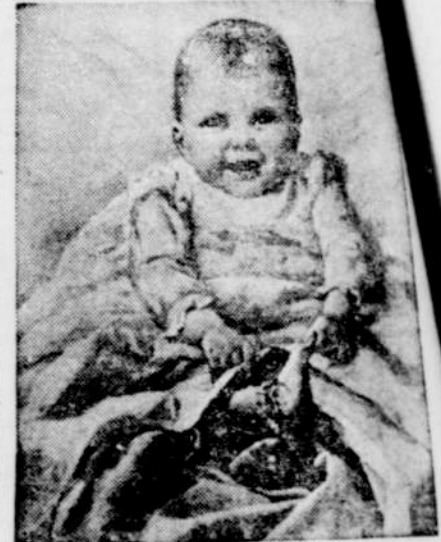
"I'M A DAIRY."

DO YOU WANT TO ADOPT A BABY? Maybe you think this is a new sending out babies on application done before, however, but never furnished been so near the original this one. Everyone will exclaim, that's the sweetest baby I ever saw. little black-and-white engraving on you but a faint idea of the exquisite