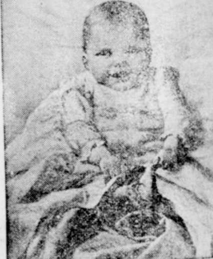
"I'M A DAISY."

Maybe you think this is a new business, sending out babies on application; it has been done before, however, but never have those furnished been so near the original source as this one. Everyone will exclaim, "Well that's the sweetest baby I ever saw!" This little black-and-white engraving can give you but a faint idea of the exquisite original.