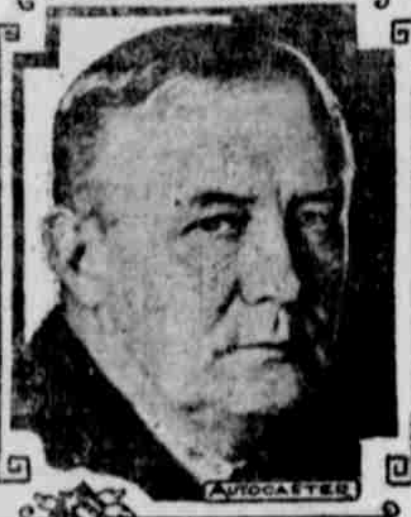
Harry S. New Postmaster General