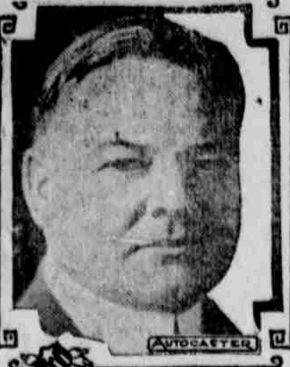
Herbert Hoover Secretary of Commerce