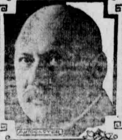
John W. Weeks Secretary of War