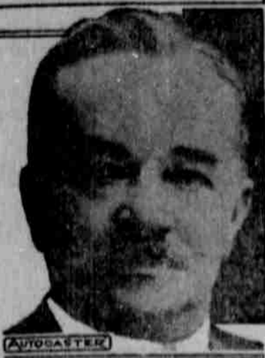
M. S. Hershey, "Chocolate King," sets a new philanthropic record by giving $60,000,000 to the Hershey School for Orphan Boys. His entire estate reverts to the school through trustees after his death.