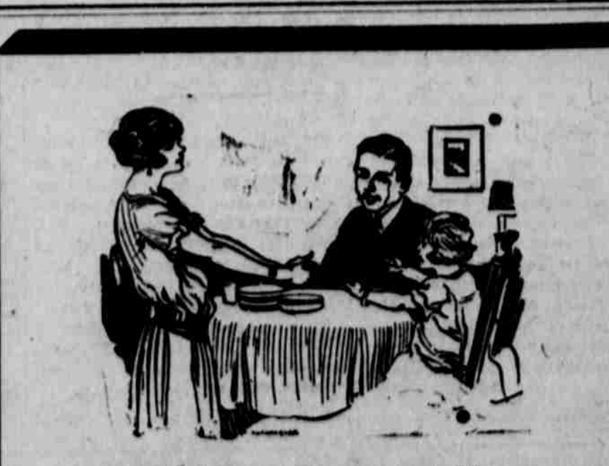
Table Test Tells

2 Room Business Suite on Ground floor in center of Business District $15.00 per month .--- Inland Empire Realty Co. Phone 30W.