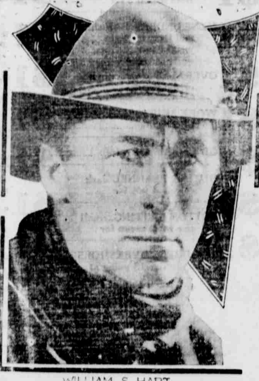
WILLIAM S. HART

Candy, Nuts, Figs, Cookies, Apples, Cranberries, Olives, Dates, Pickles. In fact everything for your Xmas table.