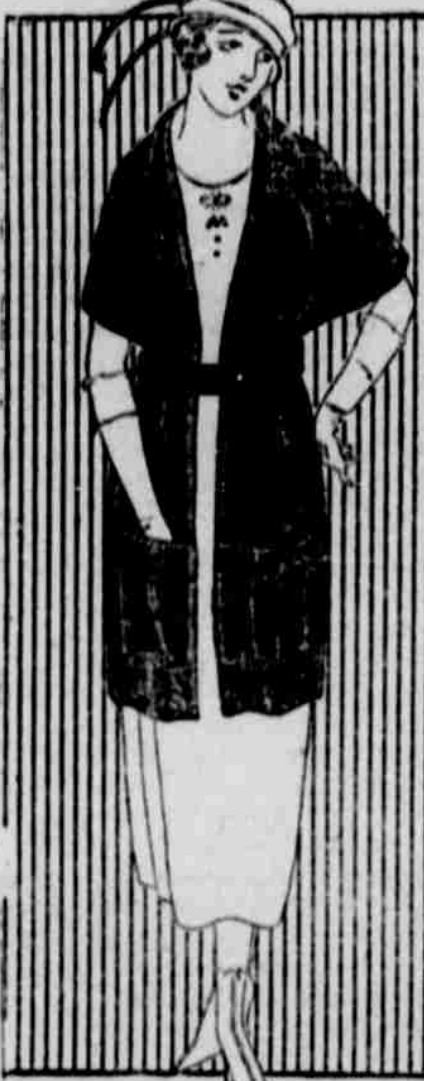
This smart scarf of seal plush serves Milady as jacket and scarf.