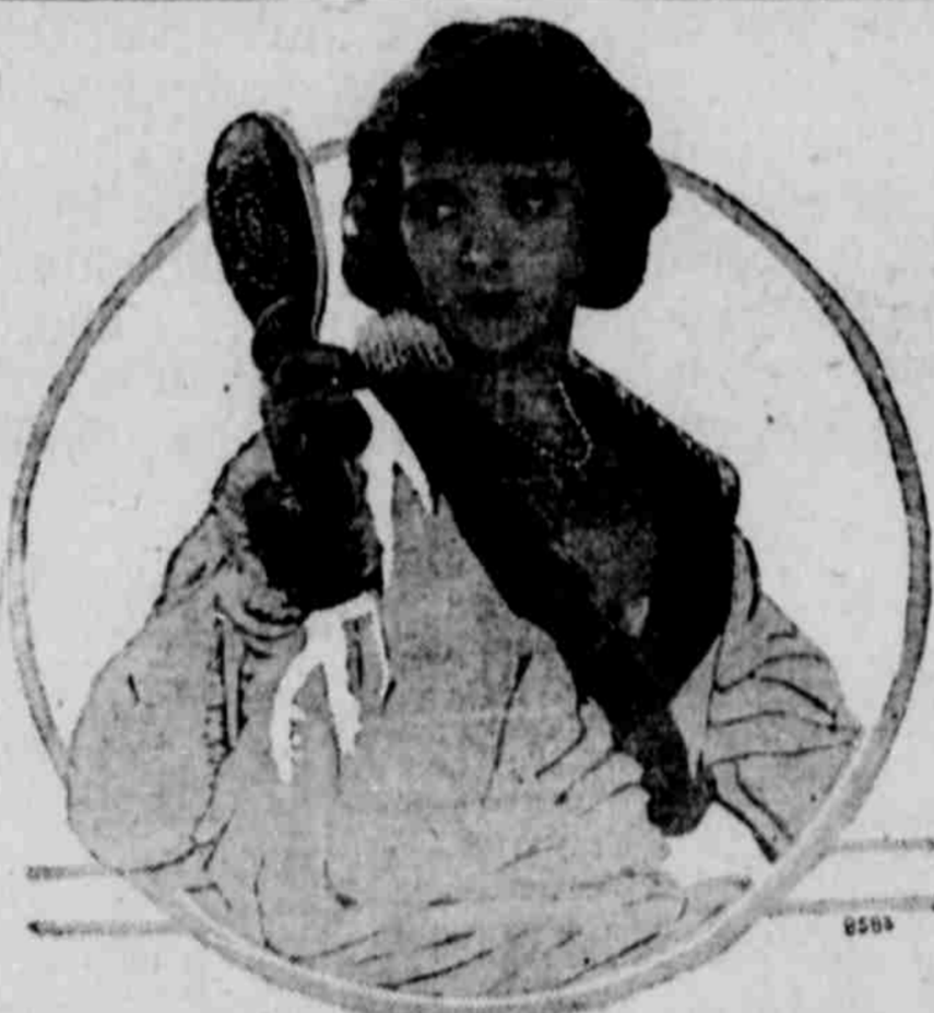
"I guess that will do" BILLIE BURKE in "Good Gracious, Annabelle" A Paramount Picture

The story has a Western atmosphere which later changes to the East, whither Annabelle Leigh, the