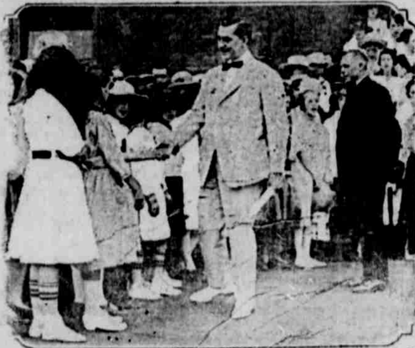
Boy and girl corn club winners of Maryland have an advantage over other state competitors in one way. That is their nearness to Washington. This shows the various Maryland winners who enjoyed trip to Washington and the Agriculture Department, where they were personally presented to Secretary of Agriculture Meredith.

The Reds recently captured by the life who were friends of Harding and Poles belle their name. They are Cox in former days that one is led some blue. to suspect that the entire population of the United States has lived in Ohio at one time or another.