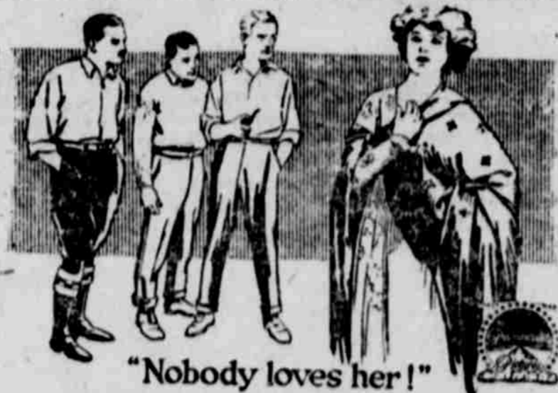
"Nobody loves her!"

That haters of women have no place in society and that their pretensions are insincere, is adequately