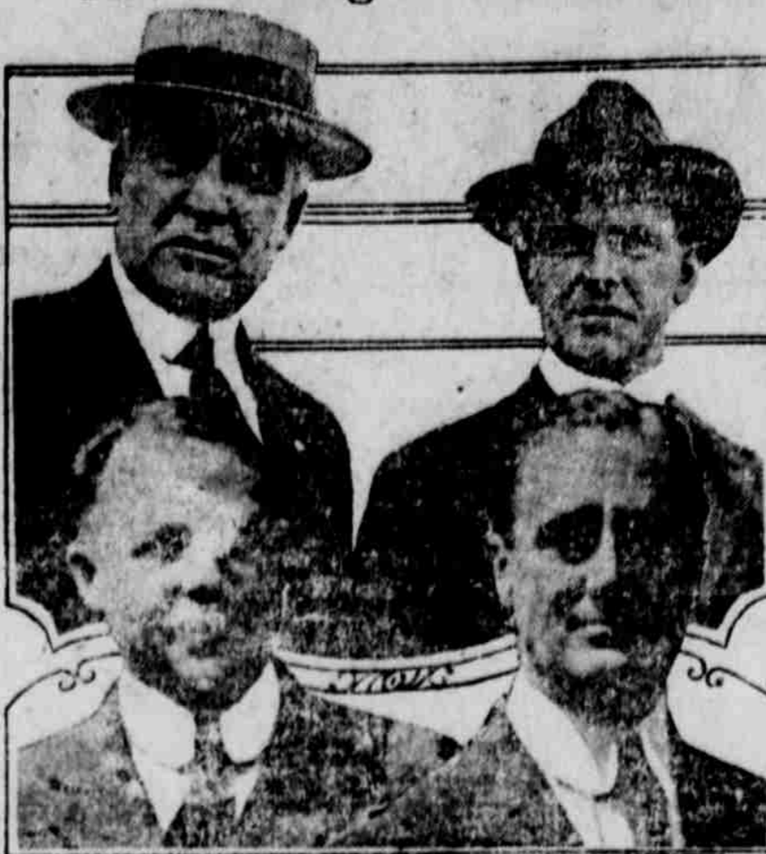
Washington conferences were important events in the affairs of both the Republican and Democratic nominees and these two pictures show better than any others just how the candidates stack up. It shows Harding and Coolidge, Cox and Roosevelt as Washington saw them together—the best pictures of all four that have been taken since the nominations.

All roads of industry lead to wealth, but most people take the back track.