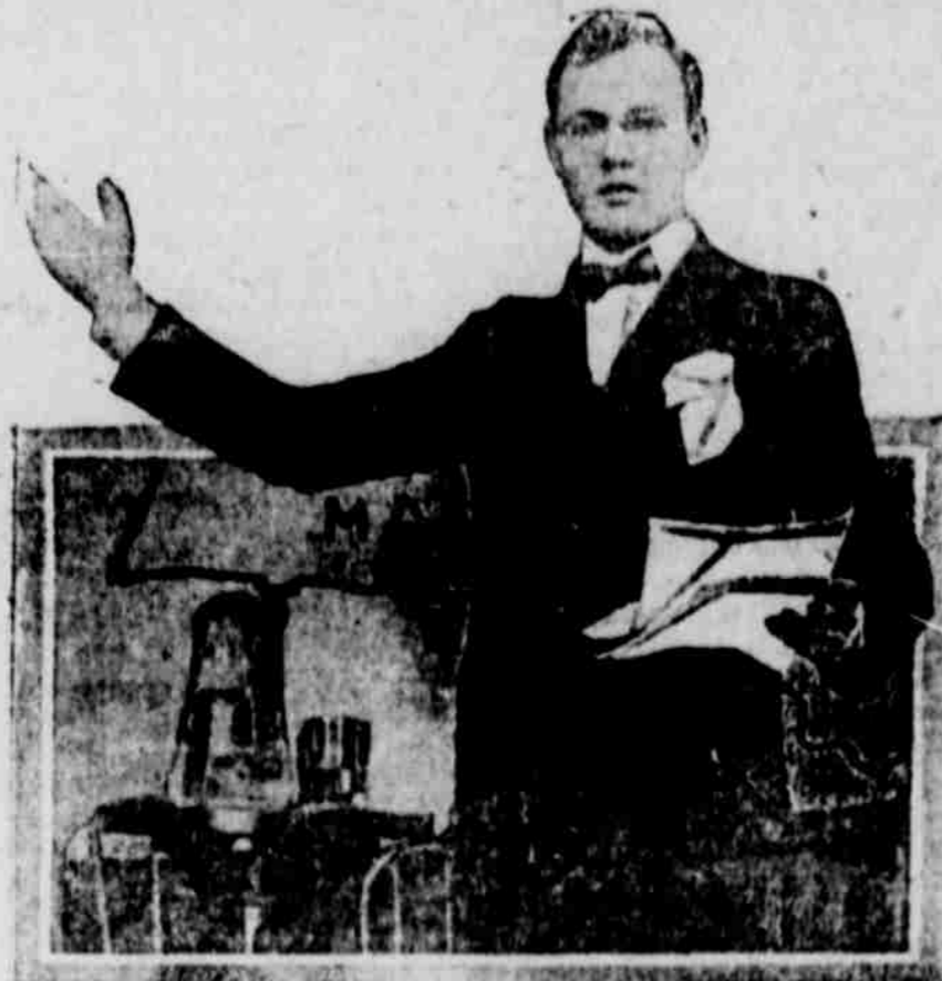
Under the village chestnut tree Thomas U. Ince presents CHARLES RAY in "String Beans" A Paramount Picture

Isn't that a typical Ray title? "String Beans!" And it is also quite appropriate for the efforts of a sharper to swindle a guillible lot of farmers with a false cannery project for beans is the basis of the story, which will be seen at the Liberty theatre on next Wednesday. It is a Thomas