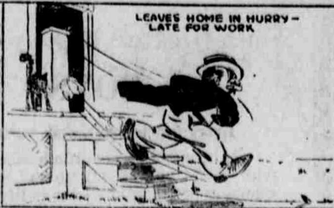
LEAVES HOME IN HURRY - LATE FOR WORK.