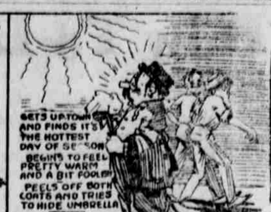
GETS UP TOXIC AND FINDS IT'S THE HOTTEST DAY OF SEASON BEGINS TO FEEL PRETTY WARM AND A BIT POOLY. PEELS OFF BOTH COATS AND TRIES TO HIDE UNDER UMBRELLA.