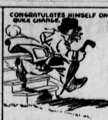
CONGRATULATES HIMSELF ON QUICK CHANGE.