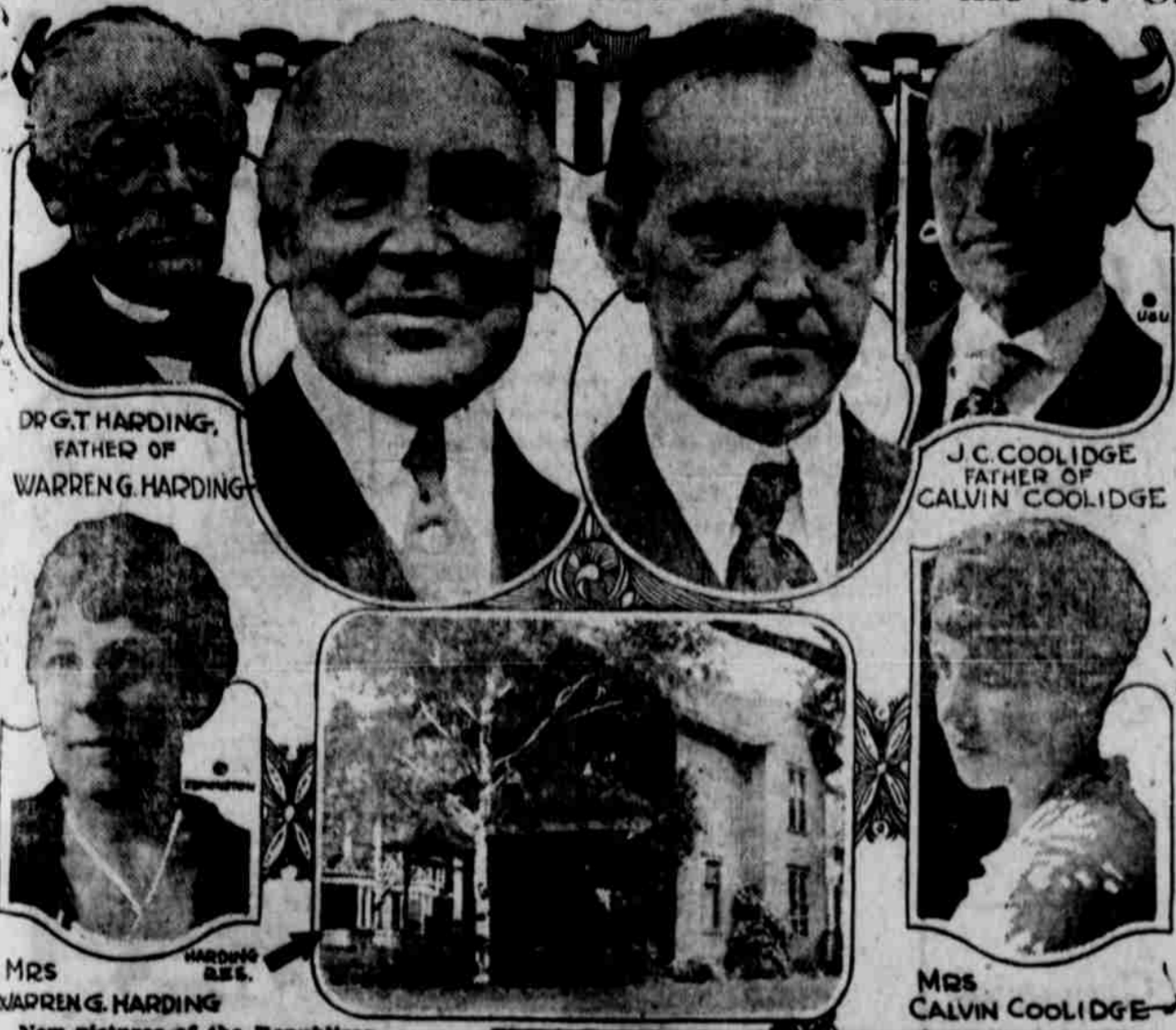
New pictures of the Republican nominees taken since they were named to lead the ticket—and the proud "I told you so" group of daddies and wives of the two families. The picture of the house is where the Republican National Committee will conduct its campaign. It is the Christine residence at Marion, Ohio, next door to the home of Senator Harding. Governor Harding will conduct his campaign from his own front porch—making only a few major speeches—according to present plans.

posting 'em. You might reach a man's eye at the cross roads or post-office, but with the local paper you put the announcement in his house and in his hands, and I couldn't sell my surplus stock except by doing a lot of work that'd cost more than an ad in the paper and wouldn't give as good results.