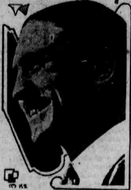
Georges Carpentier, European heavyweight champ, his bride and fistie manager are in the U. S. He comes to fill theatrical and movie engagements and arrange for a title clash with Jack Dempsey.

assures us that some day a woman will sit in the presidential chair. Not a doubt of it. And in all of the days we have been burdened with such an animal as a president we'll wager that the wife of every one of them has surreptitiously deposited her avoirdupois in that same old overworked chair.