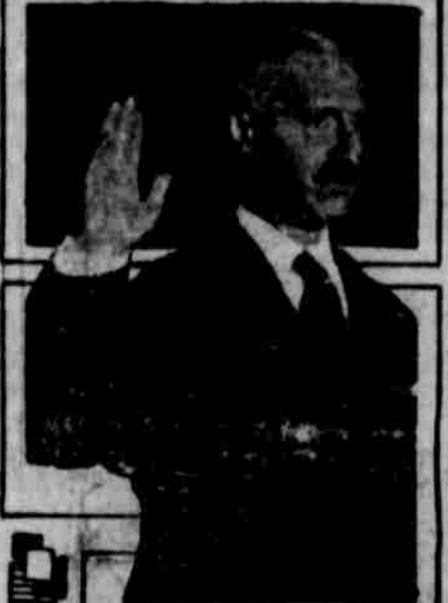
Bainbridge Colby, new secretary of state, to succeed Robert H. Lansing, shown here taking office, his appointment being confirmed by the Senate.