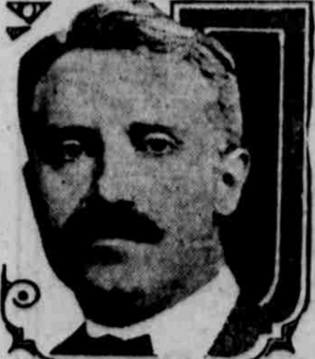
Bainbridge Colby, New York lawyer, former Republican and supporter of Roosevelt in organization of the Bull Moose party, is the new secretary of state in President Wilson's cabinet to succeed Robert Lansing. His appointment faced a fight in Congress and was a big surprise to both Democrats and Republicans.