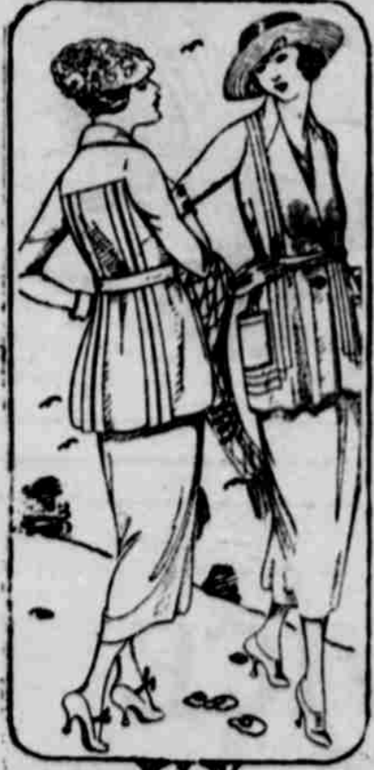
Navy blue has always been considered a staple color in suits. This year it is the leading color predominating in both the ston and bolero. Navy tricotine and jersey rooks and twine colors are the materials used in the two models shown above. Note the open seams, double patch pockets and full skirted jackets. The selection of hats has been followed out very carefully. On the left a small flower bonnet gleams in all spring brightness. On the right a soft brim roll sailor; dark blue with a light straw facing.