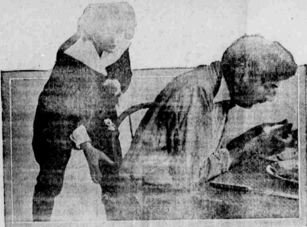
Thomas H. Ince presents ENID BENNETT in "A Desert Wowing" A Paramount Production

Avie Bereton is a product of the social set, with her carnality for love and the better things of life dwarfed and subdued by her associations and upbringing. Her mother is in sore financial straits and plans to marry her daughter to wealth to rehabilitate her own fortunes. Avie is admired and cynically returns the attentions of a Dr. Fortesque Van Fleet, social parasite. Billy, her brother, is more or less of a young waster. From the West comes Barton Masters, a multimillionaire copper man