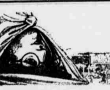
Tortoise Shell Auto Glasses AT SALISBURY'S