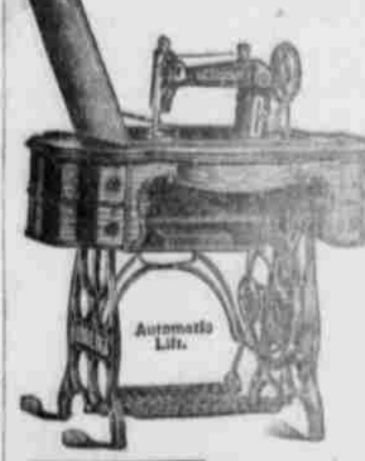
Save Money by buying this reliable, honest, high grade sewing machine.

STRONGEST GUARANTEE. National Sewing Machine Co., SAN FRANCISCO, CAL. FACTORY AT BELVIDERE, ILL.