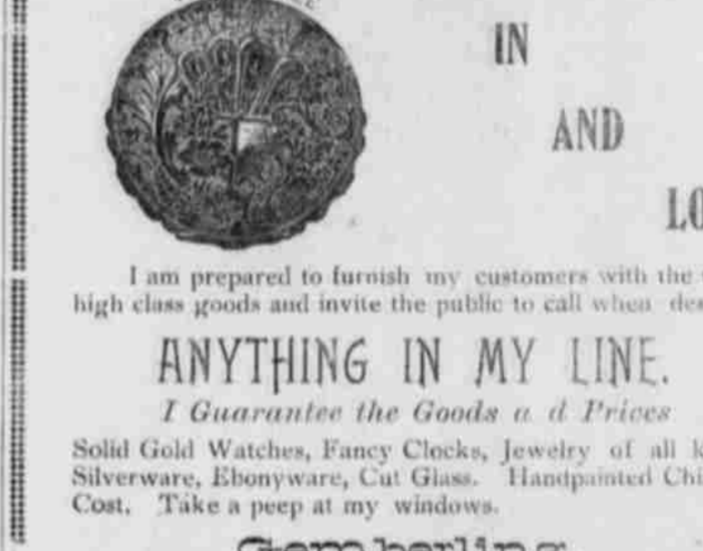
DROP IN AND LOOK

I am prepared to furnish my customers with the usual high class goods and invite the public to call when desiring ANYTHING IN MY LINE.