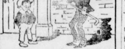
The Masher—Does your sister know I am out here waiting for her? The Boy—Oh, yes! She gave me a penny to tell her when you had gone.—Boston Globe.

Why, with all the instinct animals possess, is the desire so strong to injure or destroy rather than to help or rescue?—New York Sun.