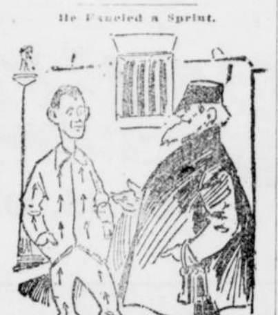
He Fainted a Sprint.

Pretty For Co. A summer resident in a New Hampshire village, a lady who, in Horace Walpole's phrase, "sits at the top of the world," was making her first friendly call of the season upon the family of an old widower.