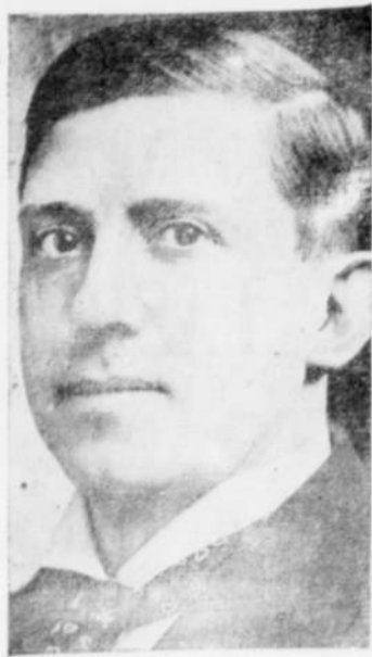
CHARLES M. SCHWAB

Who last week resigned as president of the big steel corporation.