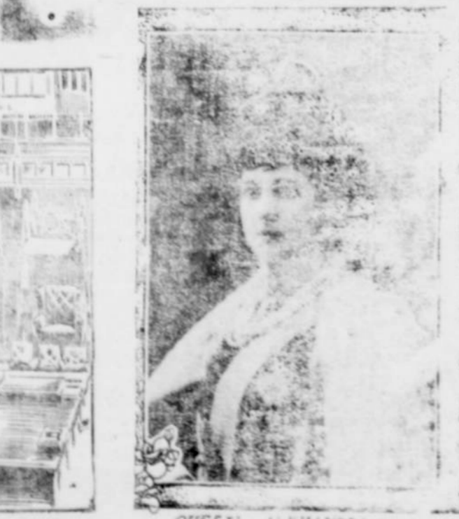
King Edward and Queen Alexandra are now Making a Tour of Ireland