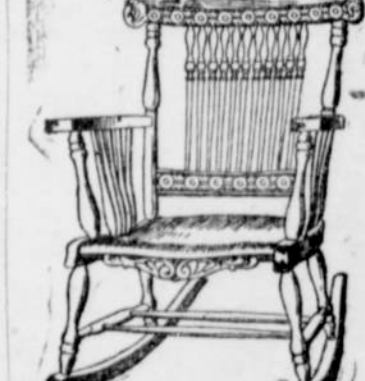
Burns Furniture Co., Burns, Ore.

We discount all others on carpets, rugs, art squares and portiers.