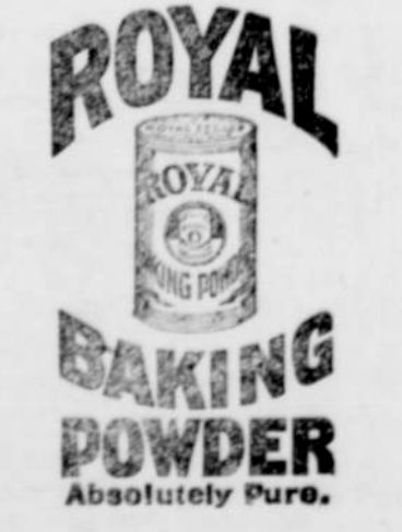
ROYAL BAKING POWDER Absolutely Pure.