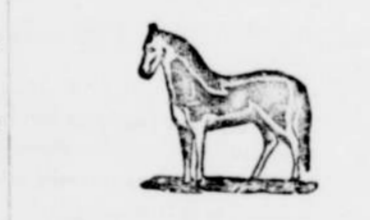
Free brand colman.