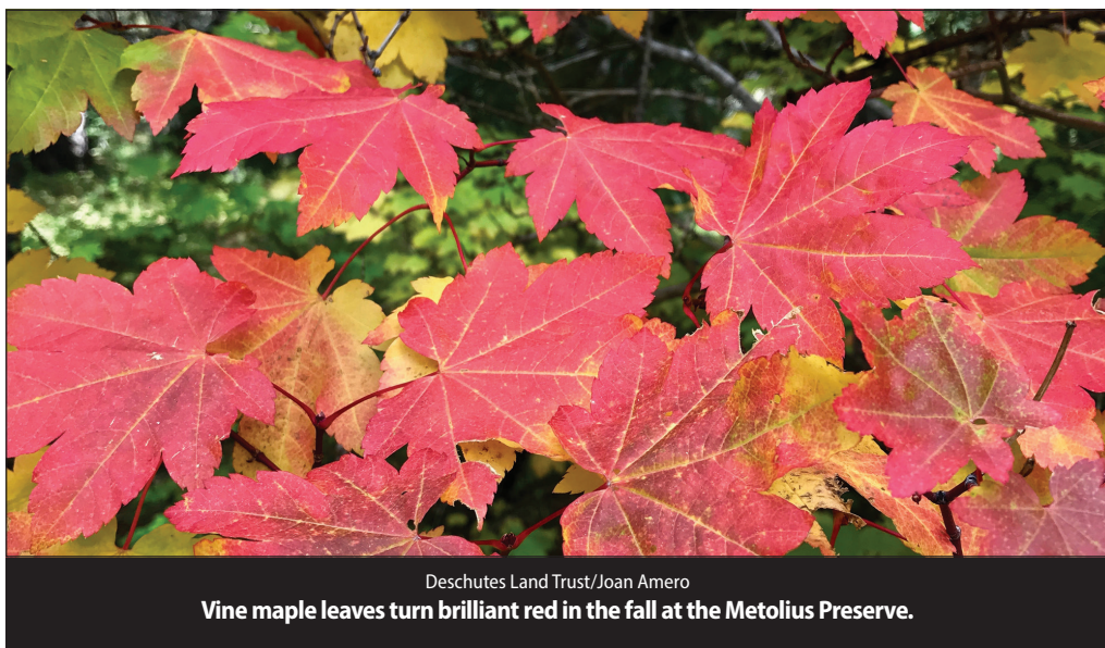
Vine maple leaves turn brilliant red in the fall at the Metolius Preserve.