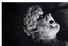
Lon Chaney Jr.