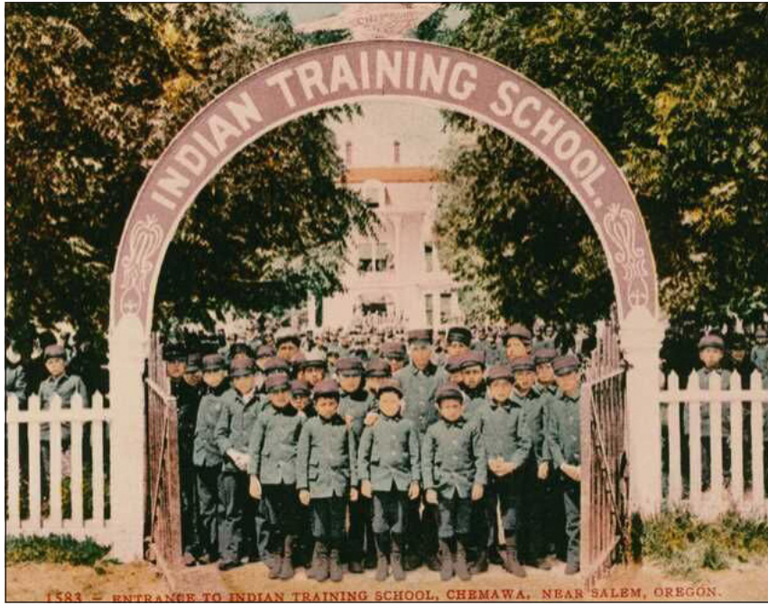
Students stand in front of the Chemawa Indian School in 1905.