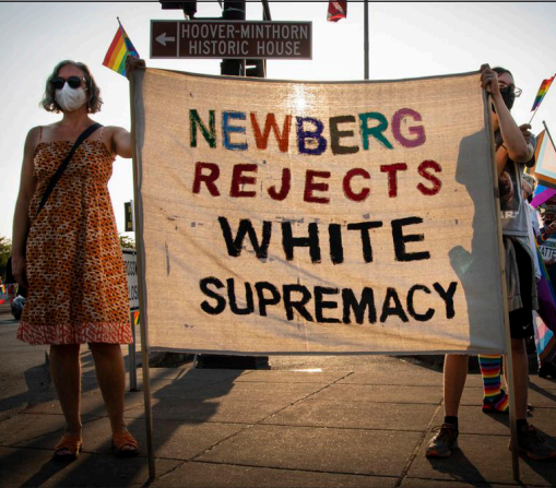
People protest on Aug. 24 a school policy that bans Black Lives Matter and Pride flags across Newberg School District.

voted to ban pride flags, flags reading Black Lives Matter and any broadly "political" signs, clothing, and other items. Supporters of the ban said the signs were "divisive," and that signs don't make people feel safe.