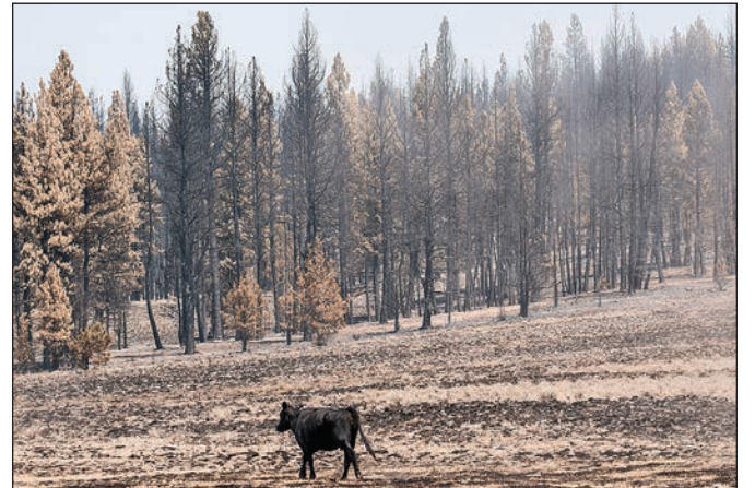
A cow walks through an area damaged by the Bootleg Fire near Bly.

Across the Washington border, the Lick Creek Fire, also burning in the Umatilla National Forest, had burned more than 78,000 acres, with containment at 55%, according to InciWeb.