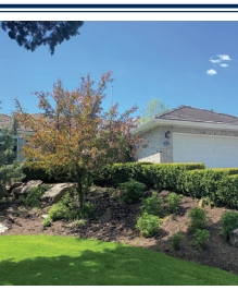
3317 NE STONEBROOK LP 4 BD | 3.5 BA | 3750 SF | $725,000

21322 Starling Drive 1800+ sq. ft. 5 bedroom + office in NE Bend Team Birtola High Desert Realty 541-312-9449