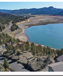
944 NE SHORE LINE RD 1.03 AC | $235,000

100% ready-to-build homesite in the heart of Bend, overlooking Farewell Bend Park & the Deschutes River! SDC fee is paid, all utilities are in, city street improvements are paid, excavation is complete, and 1900+ SF single-level floor plans with the sale! MLS#220127378