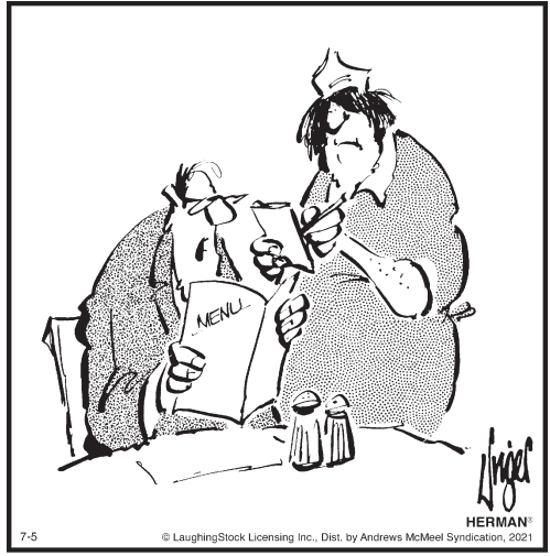
"If you've stopped serving breakfast, I'll have a bowl of corn flakes for lunch.'