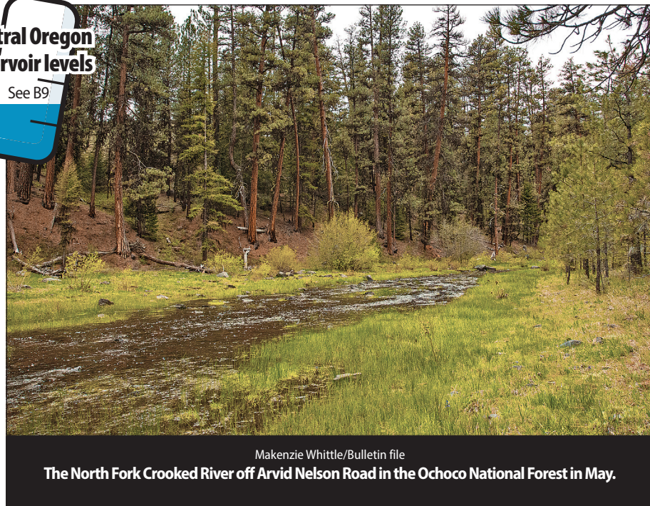
Central Oregon reservoir levels See B9