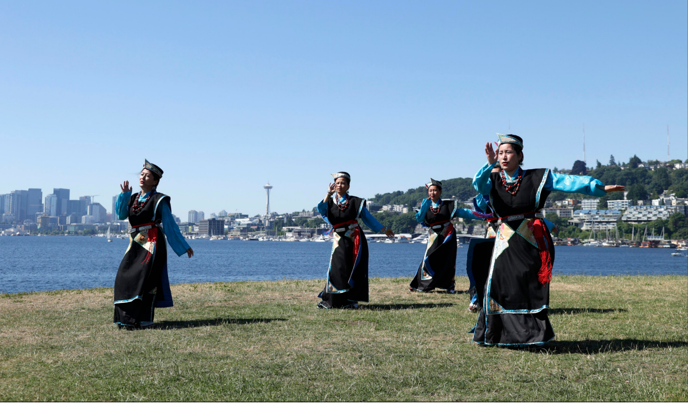
With the Space Needle in the background, members of a Seattle Tibetan Choelsum Bhumo dance group record a video for an upcoming virtual festival in the morning during a heat wave hitting the Pacific Northwest on Sunday.

Still, about 3,000 athletes participated in an Ironman Triathlon in Coeur d'Alene,