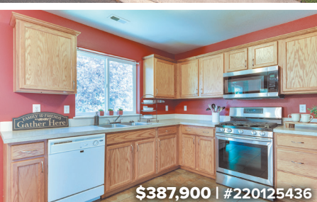
2875 SW Deschutes Drive, Redmond Great one-level home, 3 bed, 2 bath with open