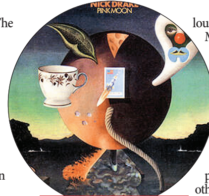
Nick Drake’s “Pink Moon”