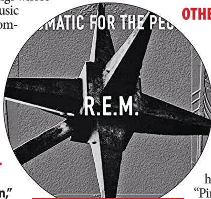
R.E.M.’s “Automatic for the People”

plores “Moon blue, lift me to starry heights, I long to live within your light.”