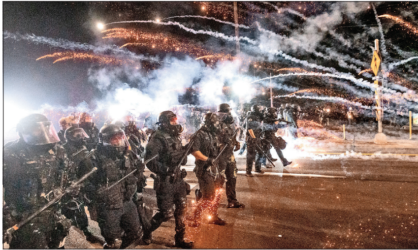
Police use chemical irritants and crowd control munitions to disperse protesters during a demonstration Sept. 5 in Portland.