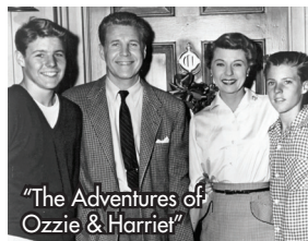
“The Adventures of Ozzie & Harriet”