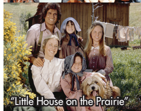
“Little House on the Prairie”

Ozzie Nelson (Ozzie Nelson), “The Adventures of Ozzie & Harriet” (ABC, 1952-66) No one could have played David and Ricky's dad better.