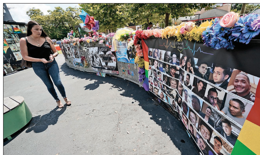
A visitor looks over a display with the photos and names of the 49 victims who died at the Pulse nightclub memorial Friday in Orlando, Florida. Saturday will mark the fifth anniversary of the mass shooting at the site.